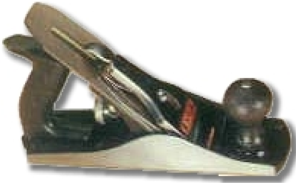
Wood Working Tools